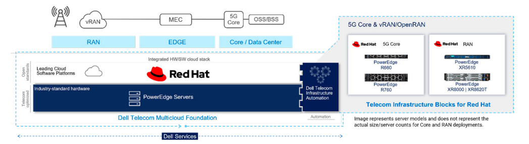
Figure 1: Dell Telecom Multicloud Foundation and Telecom Infrastructure Blocks for Red Hat

But what happens when you want to build capabilities on top of those building blocks? Dell has you covered with partner-powered offerings that extend the capabilities of our Infrastructure Blocks to support solutions from the industry's leading vendors. For example, consider network policy and charging. If Infrastructure Blocks are the legs of your network that help you stand up a cloud network and move forward, then policy and charging are the brains and treasury of your network, respectively. As a pre-engineered system, inclusive of Dell Infrastructure Automation Software, Dell PowerEdge servers and Red Hat® OpenShift® container platform, Infrastructure Blocks are a natural fit for Amdocs Policy and Charging Control (PCC), an established leader in 5G policy and charging.