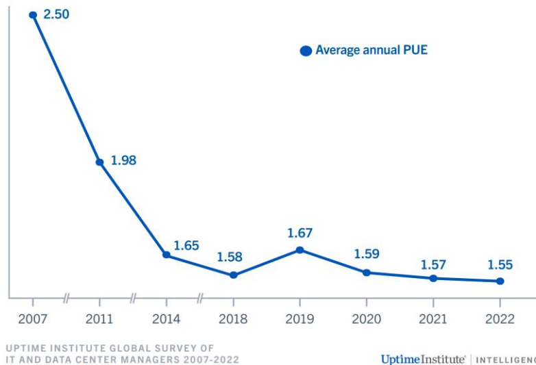
Figure 1. Average annual PUE per Uptime Institute, Intelligence Global Survey of IT and Data Center Managers 2007 to 2022

Ideally PUE has a value of 1.0, meaning that each watt from the utility is used to power the IT. However, this is usually not the case as there is facility overhead for everything from cooling to lighting that can drive energy inefficiencies, and using PUE can help to quantify those inefficiencies. The average annual PUE has remained relatively flat since 2014, with a current average PUE of 1.55. For more information, see the Uptime Institute Global Data Survey 2022 .