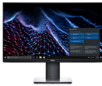
Dell 24 Monitor - P2421D

Work comfortably with an efficient 23.8" QHD monitor designed with an ultrathin bezel and small footprint.