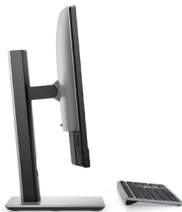
OptiPlex All-in-One Height Adjustable Stand

Raise, tilt, pivot or swivel your All-In-One to enjoy the best view.