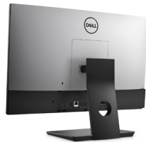
OptiPlex All-in-One DVD+/- RW enclosed with Height Adjustable Stand

Raise, tilt, pivot or swivel your All-In-One to enjoy the best view.