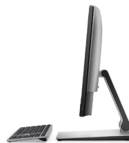
OptiPlex All-in-One Articulating Stand

In this custom Height Adjustable Stand, a DVD+/-RW drive is integrated into the base for optimal convenience.